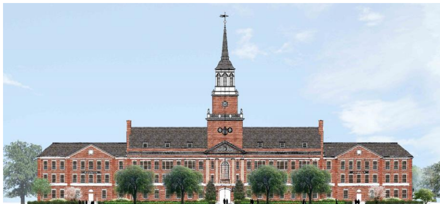
McMicken Hall Facing East