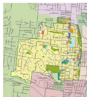
Existing Land Use